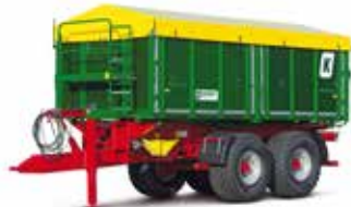
TKD 302 (20-24 t total weight)