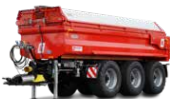
MUP 30SP (31-34 t total weight)