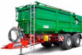
MUK 303 (20-24 t total weight)