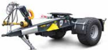
EAD 14 (14 t total weight)