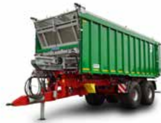
TAW 20 (20-24 t total weight)