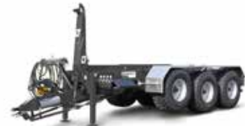
THL 30 (31-34 t total weight)