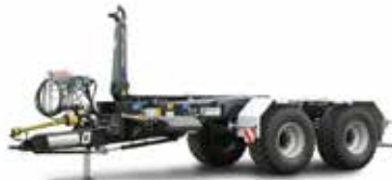
THL 20 (20-24 t total weight)