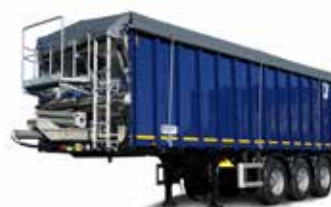
SAW 36 (36 t total weight)