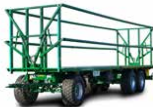
PWO 24 (24 t total weight)