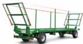
PWO 18 (18 t total weight)