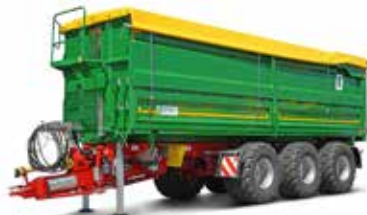
MUK 402 (31-34 t total weight)