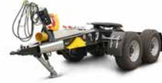
TAD 22 (22 t total weight)