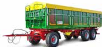
HKD 402 (24 t total weight)