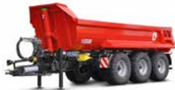
MUP 30HP (31-34 t total weight)