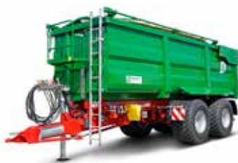
MUK 303 (20-24 t total weight)