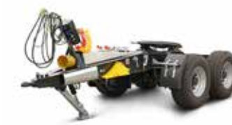
TAD 22 (22 t total weight)