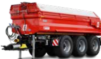
MUP 30SP (31-34 t total weight)