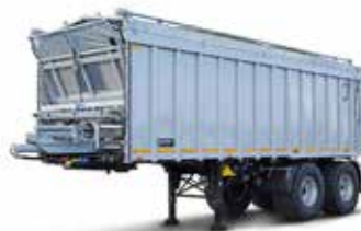
SAW 32 (32 t total weight)