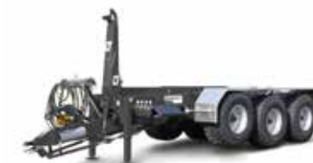
THL 30 (31-34 t total weight)