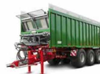
TAW 30 (31-34 t total weight)