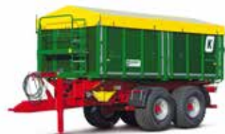
TKD 302 (20-24 t total weight)