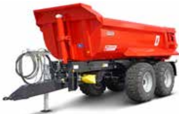
MUP 20HP (20-24 t total weight)