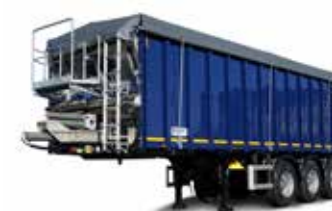
SAW 36 (36 t total weight)