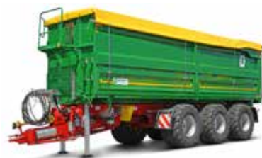
MUK 402 (31-34 t total weight)