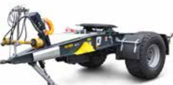
EAD 14 (14 t total weight)