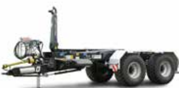
THL 20 (20-24 t total weight)